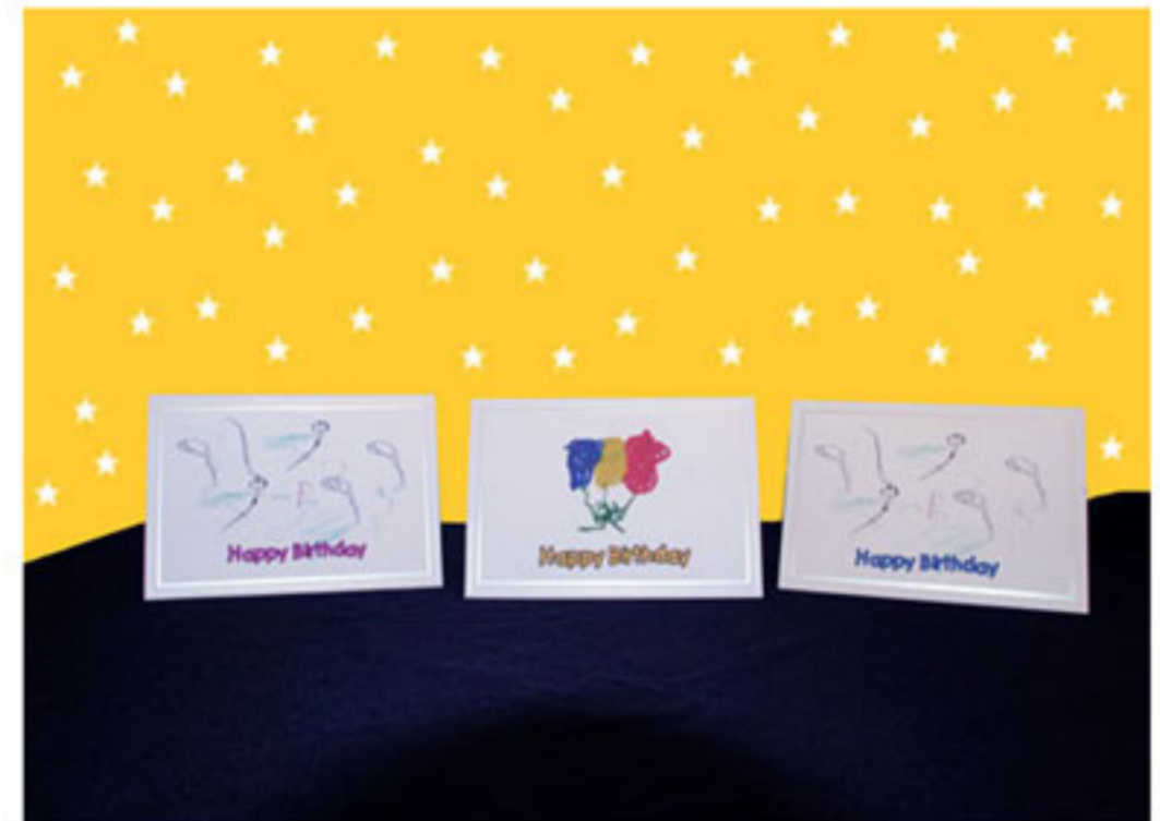
BIRTHDAY BALLOONS ASSORTMENT - AB ASSORTMENT OF 10 GREETING CARDS